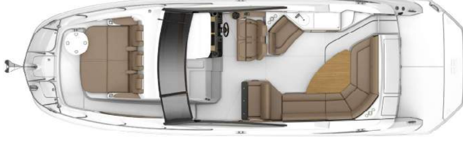
DECK / COCKPIT LAYOUT (Shown w/ Optional Equipment)