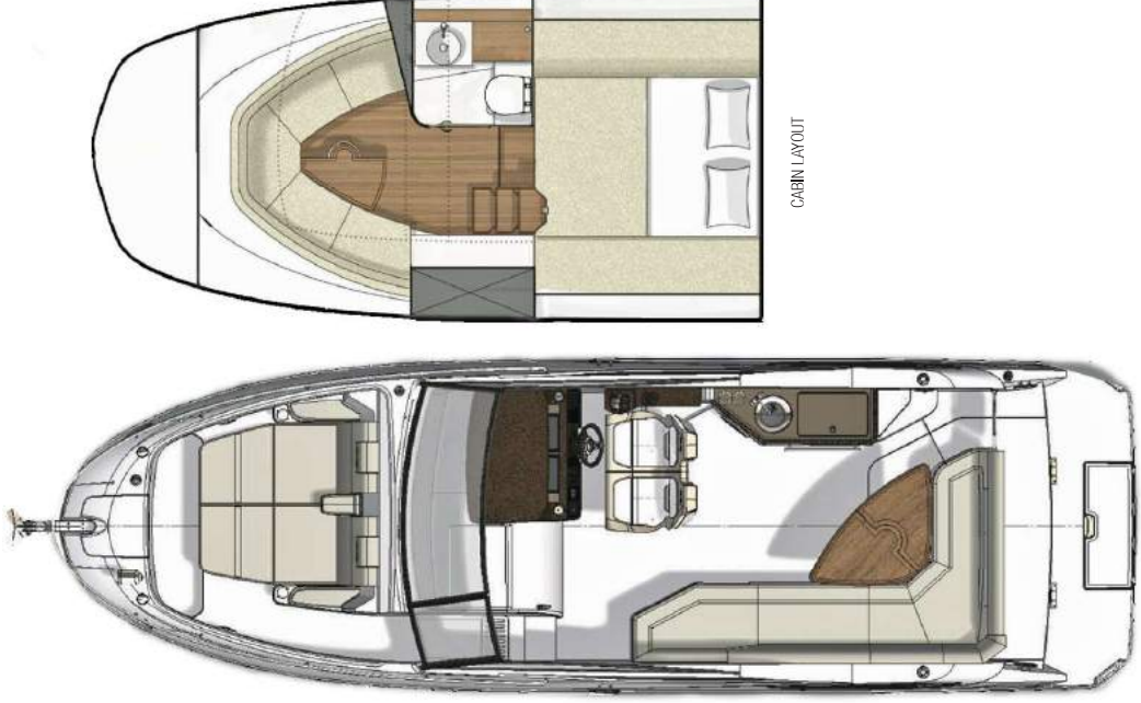
DECK / COCKPIT LAYOUT